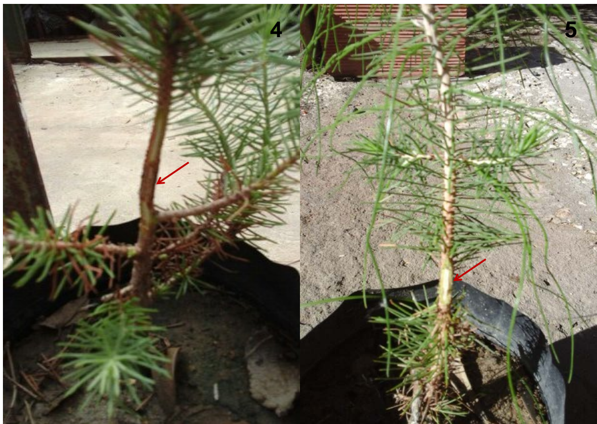
Figs 4–5 – Pathogenicity test. 4 Stem necrotic brown lesion caused by Heterotruncatella spartii on Pinus pinea seedling, 4 weeks after inoculation. 5 asymptomatic control seedling.