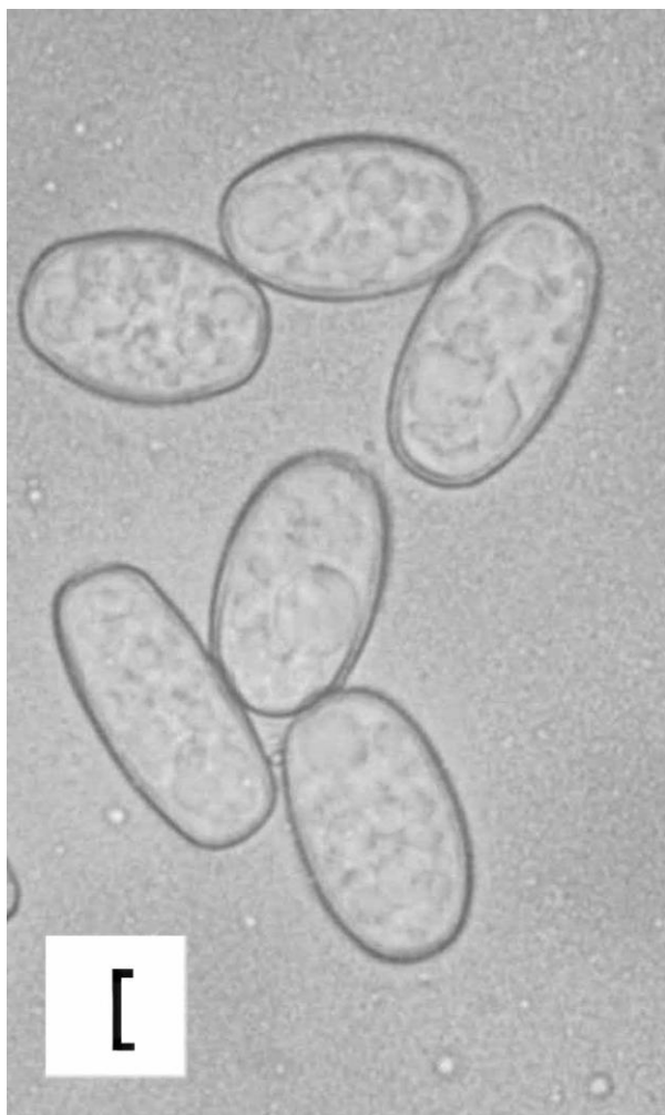
Fig. 2 – Golovinomyces orontii on Rosmarinus officinalis . Micrograph of conidia. Bar: 10 \mu m.

deposited as “ G. biocellatus ” [derived from Rosmarinus officinalis , USA, California, AB307672; R. officinalis , South Korea, FJ874774; and Salvia officinalis , USA, California, AB307674]. This result confirms that the powdery mildew anamorph on Rosmarinus has been correctly assigned to Golovinomyces . G. biocellatus and G. orontii are morphologically very similar and closely related (Braun & Cook 2012), forming an intricate assemblage in phylogenetic trees based on ITS rDNA sequences (Matsuda & Takamatsu 2003). In such groups of closely allied taxa, ITS data alone are often insufficient for the differentiation at species level (Groenewald et al. 2012). Furthermore, it must be taken into consideration that G. orontii , as currently perceived, represents a species complex comprising plurivorous as well as more specialized taxa. G. orontii is morphologically distinguished from G. biocellatus , also a compound