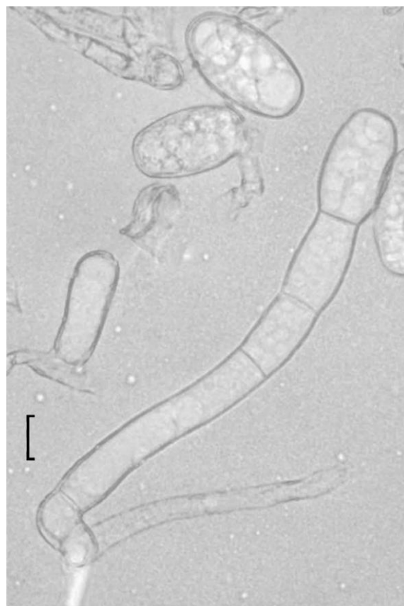
Fig. 1 – Golovinomyces orontii on Rosmarinus officinalis . Micrograph of conidiophores and conidia. Bar: 10 \mu m.

(2) Golovinomyces orontii (Castagne) Heluta ( \equiv Erysiphe orontii Castagne; Euoidium violae (Pass.) U. Braun & R.T.A. Cook, anamorph). Gadgil (2005) recorded this species on rosemary from New Zealand. Collections recently found in Germany proved to pertain to G. orontii based on morphology.