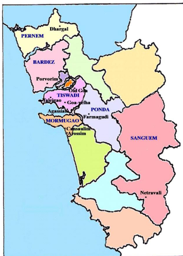
Fig. 1 – Map of Goa showing study sites

AM fungal diversity associated with agronomic crops is necessary. The objective of this study is to assess the AM fungal diversity associated with different vegetable crop plants cultivated in Goa. AM fungal colonization and soil analysis of rhizosphere soils of the agricultural fields was also determined.