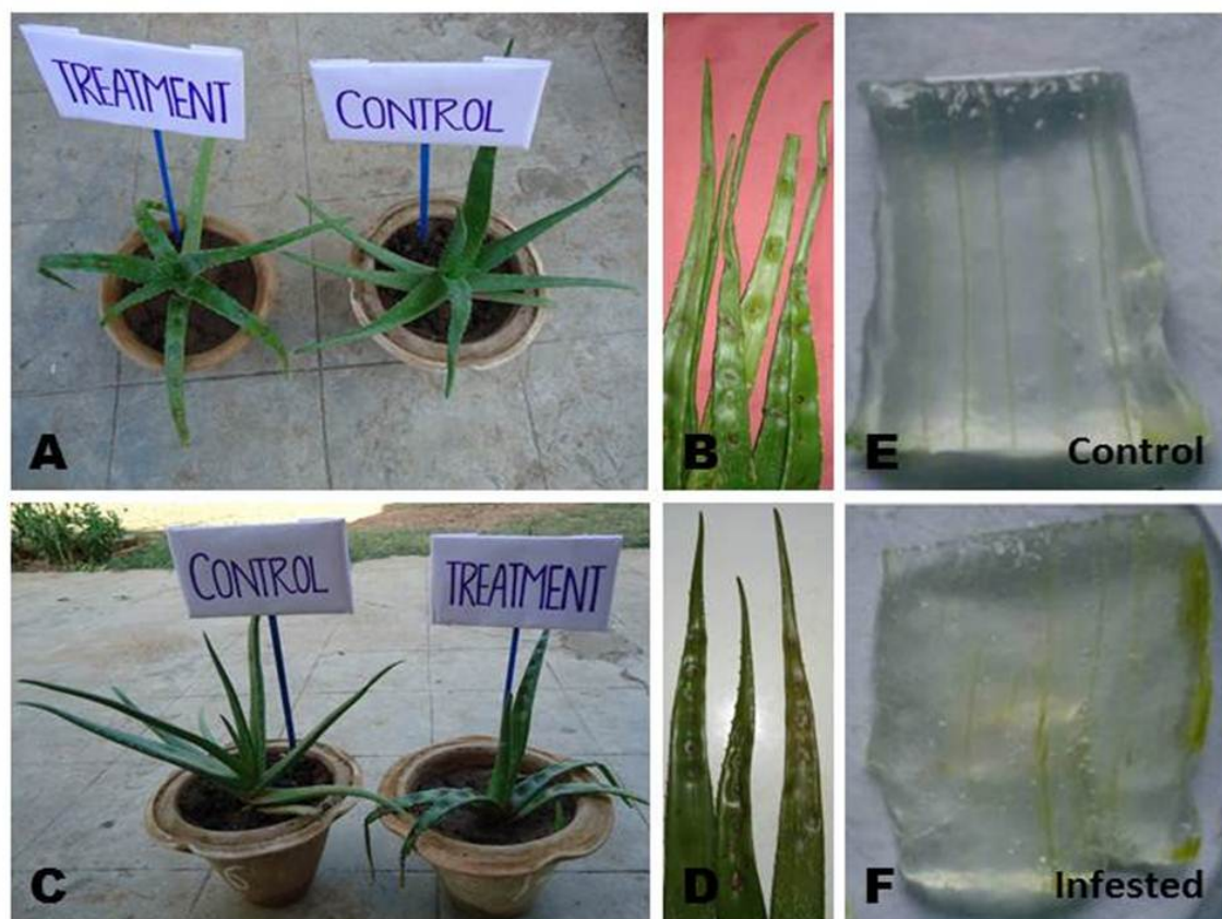
Fig. 2 – Effect of fungal infestation on morphological attributes of Aloe vera : A) F. proliferatum (growth comparison between control and infested plant). B harvested leaves. C C. gloeosporioides (growth comparison between control and infested plant). D harvested leaves. E–F appearance of gel (control and infested) infested after 32 days of infestation.