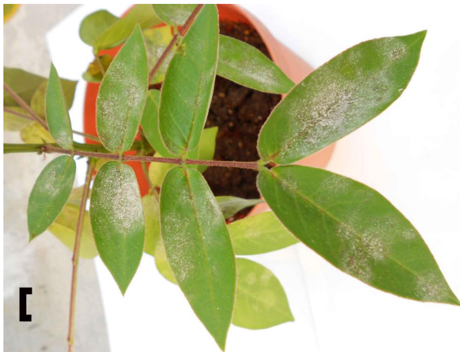
Fig. 1 – Podosphaera xanthii , symptoms (mycelium colonies) on Senna occidentalis , photo based on a potted plant from pathogenicity test. – Bar = 1 cm.

cell, erect, about 120–300 \mu\text{m} long (with conidia), foot-cells straight, subcylindrical, (30–)40–65 \times 9–12 \mu\text{m} , followed by 1–5 shorter cells; conidia formed in chains with crenulate outline, broadly obovoid (primary conidia) to ellipsoid-doliiform, (20–)25–35(–37) \times 14–20 \mu\text{m} , length/width ratio 1.3–1.9, ends rounded to subtruncate, with conspicuous fibrosin bodies.