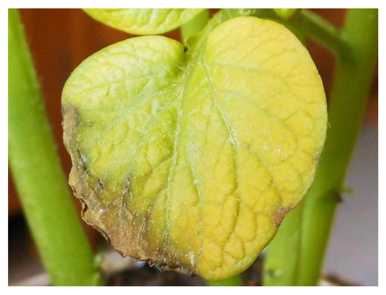
Fig. 4 – Development of whitish mycelial patches on infected leaf following pathogenicity test.