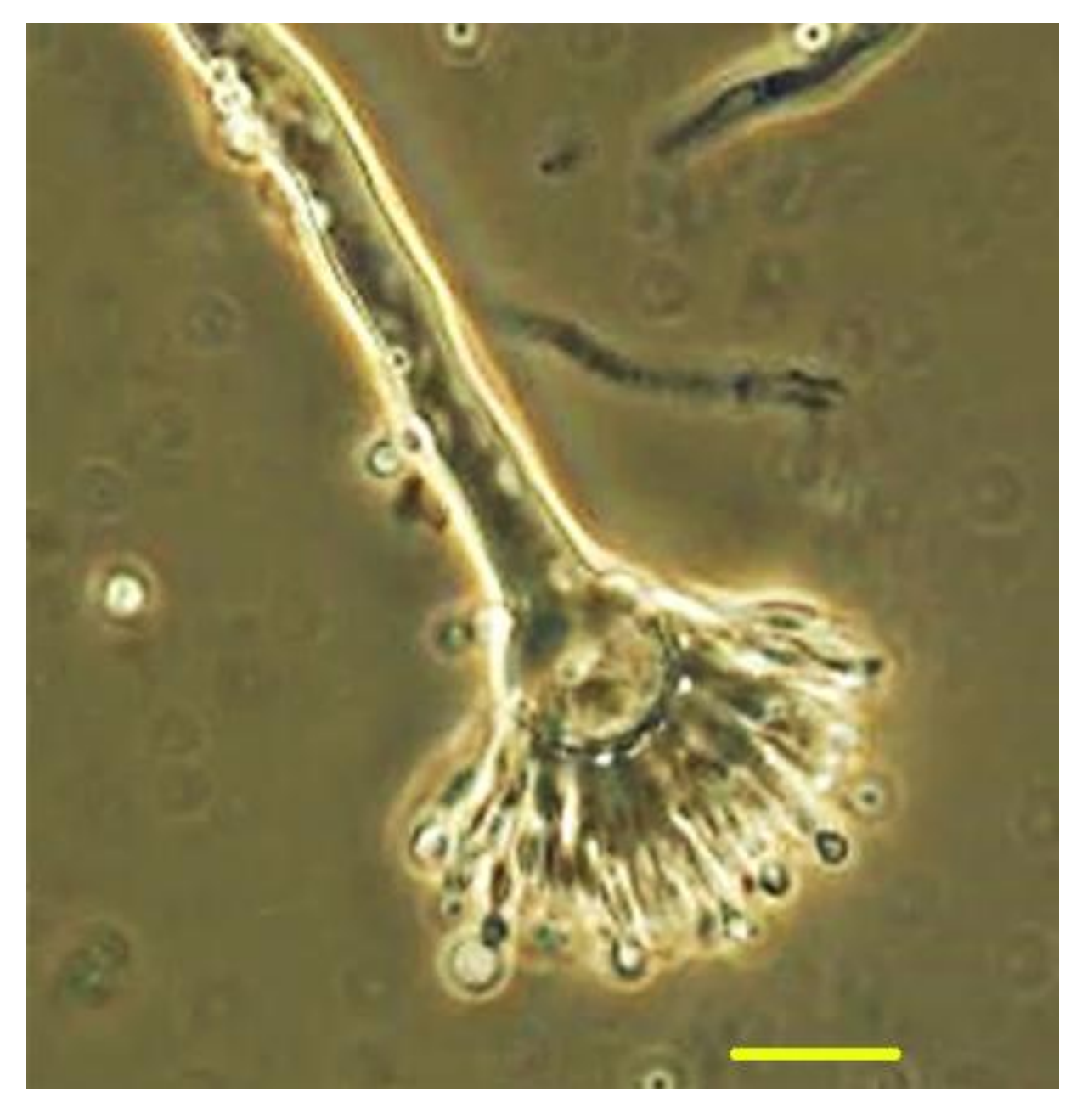
Fig. 2 – Broom-like conidiophore of Aspergillus terreus . Scale bar=30 µm.